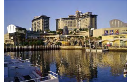
Star City, Sydney, Australia

$1.2 billion project, 120,000 sq. ft. casino with 365 hotel rooms, 140 full-service apartments, 14 restaurants, 12 bars, a 200-seat theater, a 750-seat dinner theater, a health club and parking for 5,000 cars.