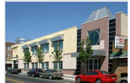
New Jersey DOL Offices