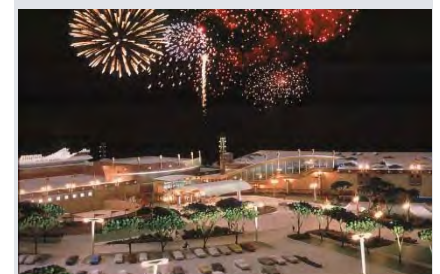
Showboat Casino, East Chicago