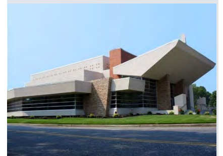
Faith Baptist Church, Atlantic County, N.J.

An aspirational and iconic symbol, this facility serves as the spiritual and cultural center of the minority community in Atlantic County. The 300-seat auditorium was designed to function as a choral performing hall as well as a spiritual center.