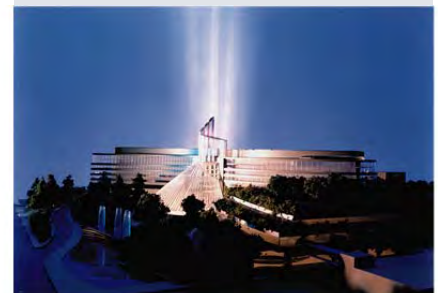
Windsor Gardens Casino, Windsor, Ontario