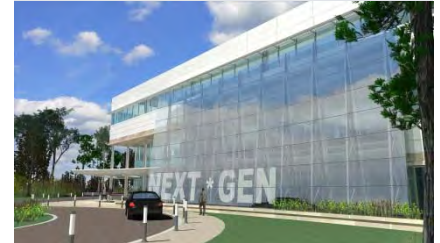
FAA NextGen, Atlantic County, N.J.