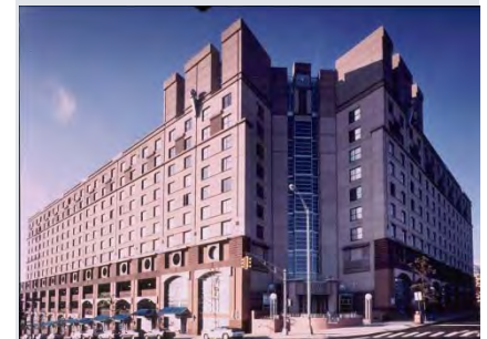
Rutgers University-Mixed Use Student Apartments New Brunswick, NJ.