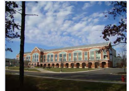
Atlantic County Justice Complex

$65 million project, 180,000 sq. ft. with prosecutor's office, county sheriff's department and courtrooms.