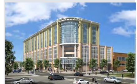
Centurion Plaza Mixed Use, Atlantic City